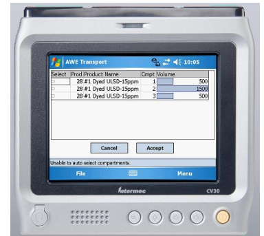
AWT Compartment Inventory screen

seconds all in real time from your desk.