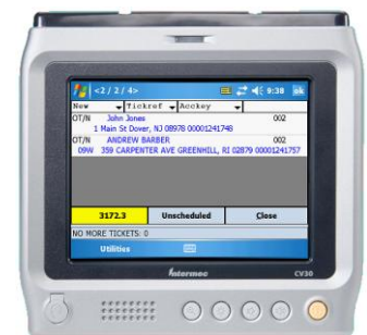
AWD Fixed Mount CV30

Dispatchers can immediately connect to any or all of the onboard computers (shown above) to update any ticket, add or delete tickets, pullback tickets, add new instructions, add or change a preset to a specific volume or dollar amount and can even change pricing globally or